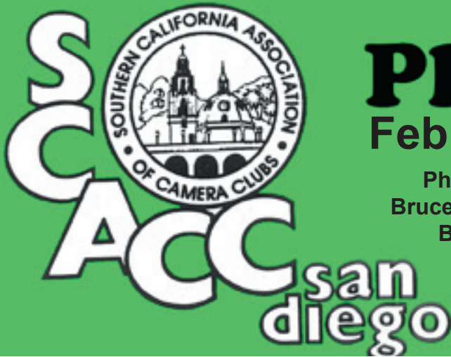
Photo Flash Feb. / March 2005